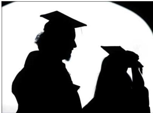
How can we ensure new doctors remain fit to practise?

The fifth report of the Shipman inquiry provided a thorough and considered analysis of the issues surrounding fitness to practise. 1 We must all approach the report in the spirit of learning from the past and as a source of ideas for improving the protection of patients in the future. The government's proposals to improve death certification and for tighter regulation of controlled drugs 2 will, alongside clinical governance, help stop another Harold Shipman. Nevertheless, the General Medical Council recognises that further changes are required to our processes.